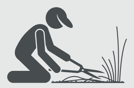
Through various partnerships, VITALITE will provide training videos that farmers can watch, discuss, apply and revise.

Through PAYGO [Pay as you go] Vitalite is also able to extend an offering tailored to small holder farmers. A suit of productive use farming products will be provided to farmers as they climb the energy ladder.